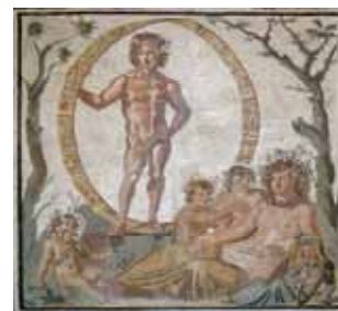
Uranus Mosaic Glyptothek Museum Munich

Herschel originally proposed to name the object Georgium Sidus , “George’s Star”, in honor of his patron, King George III. The European scientific community was not thrilled with his choice, and it was the German astronomer Johann Elert Bode who suggested that the planet be called Uranus, the Latinized version of the Greek god of the heavens, Ouranos. In 1784 the French astronomer Jérôme Lalande suggested the symbol \Upsilon to represent Uranus, describing “a globe surmounted by the first letter of your name”. In Ancient Masonry, C. C. Zain defines the origin as: